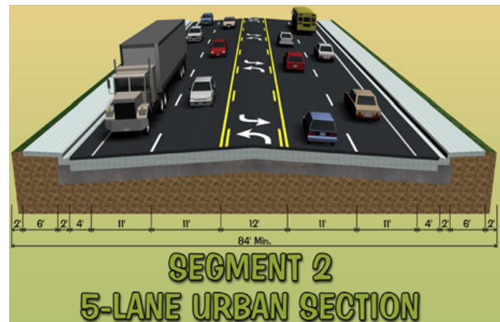
From Pinewood Boulevard to north of Alabama Road

Please join us for a Public Information Meeting on Wednesday, March 15 and a Groundbreaking Ceremony on Thursday, March 30!